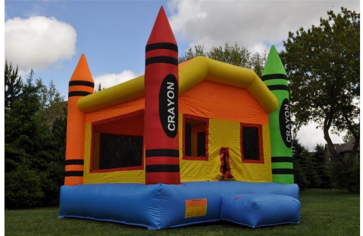
12.5' x 12.5' x 12.5'