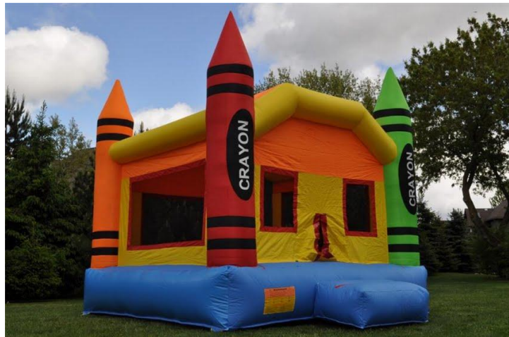
12.5' x 12.5' x 12.5'