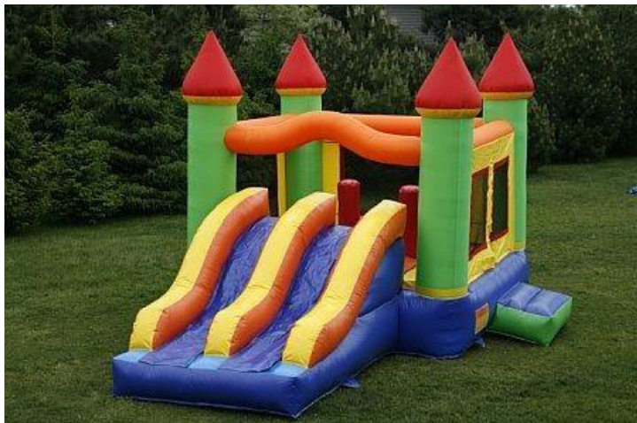
13.5' x 21.5' x 12.5'